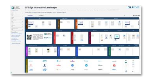
LF Edge Interactive Landscape